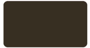
Newtowne Brown KTM-9152