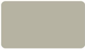
Crushed Rock KTM-4015

Water-Based Matt Finish For Interior / Exterior Wood And Cement Substrates