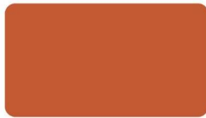
★ Tigerstripe KTM-9214