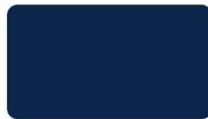
Blue Thunder KTM-9202