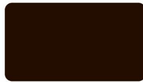
★ Winestone KTM-9181