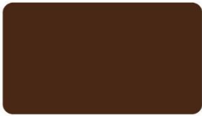
Field Oak KTM-9142