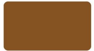
★ Harvest Orange KTM-9213