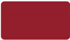
★ Knockout Red KTM-9261