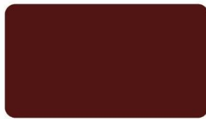
★ Robust Red KTM-9222